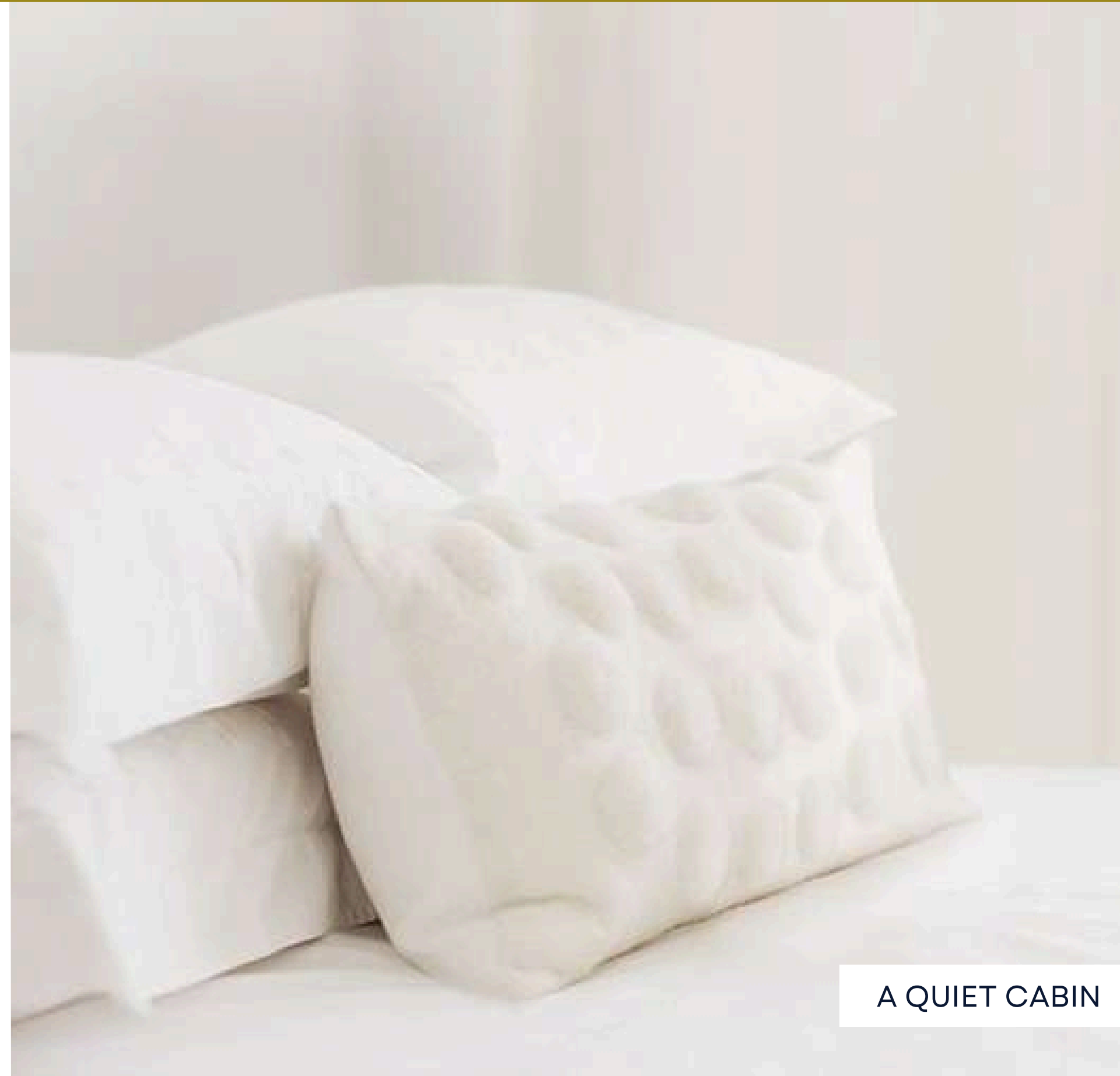
A QUIET CABIN