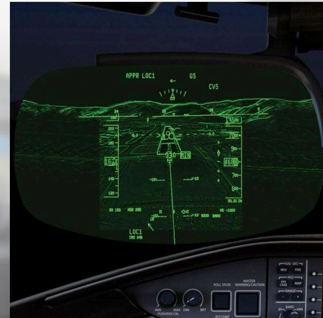
PILOT'S HUD SYSTEM