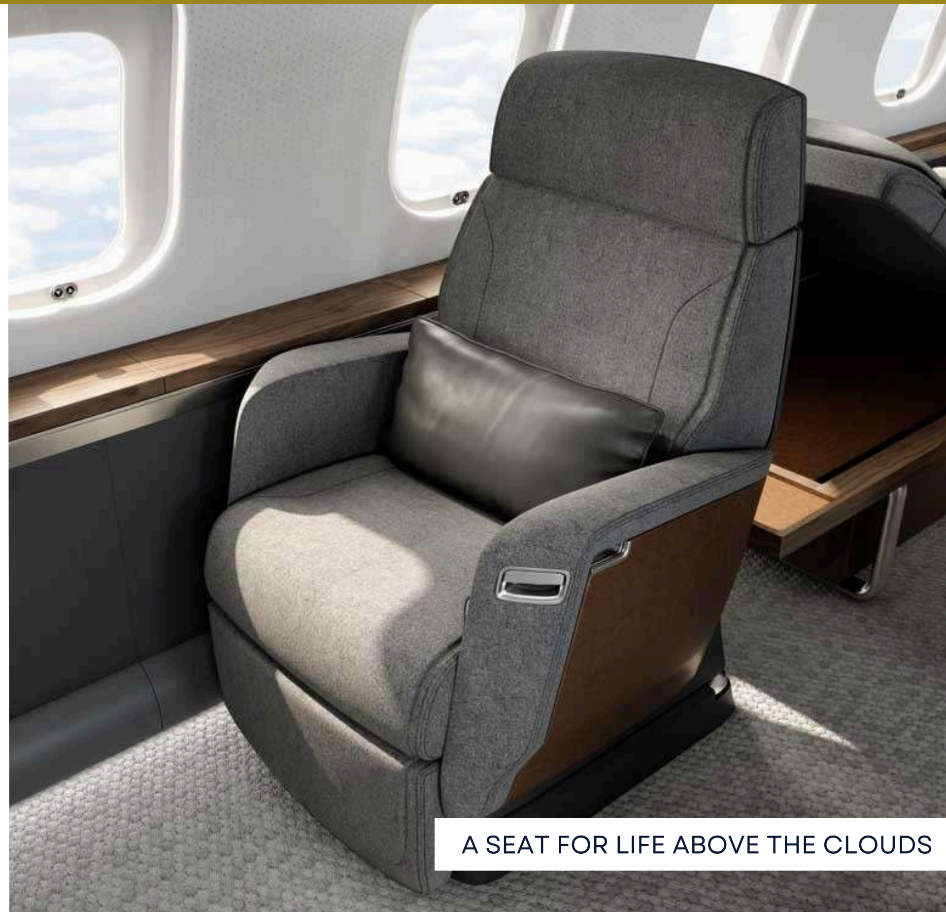
A SEAT FOR LIFE ABOVE THE CLOUDS