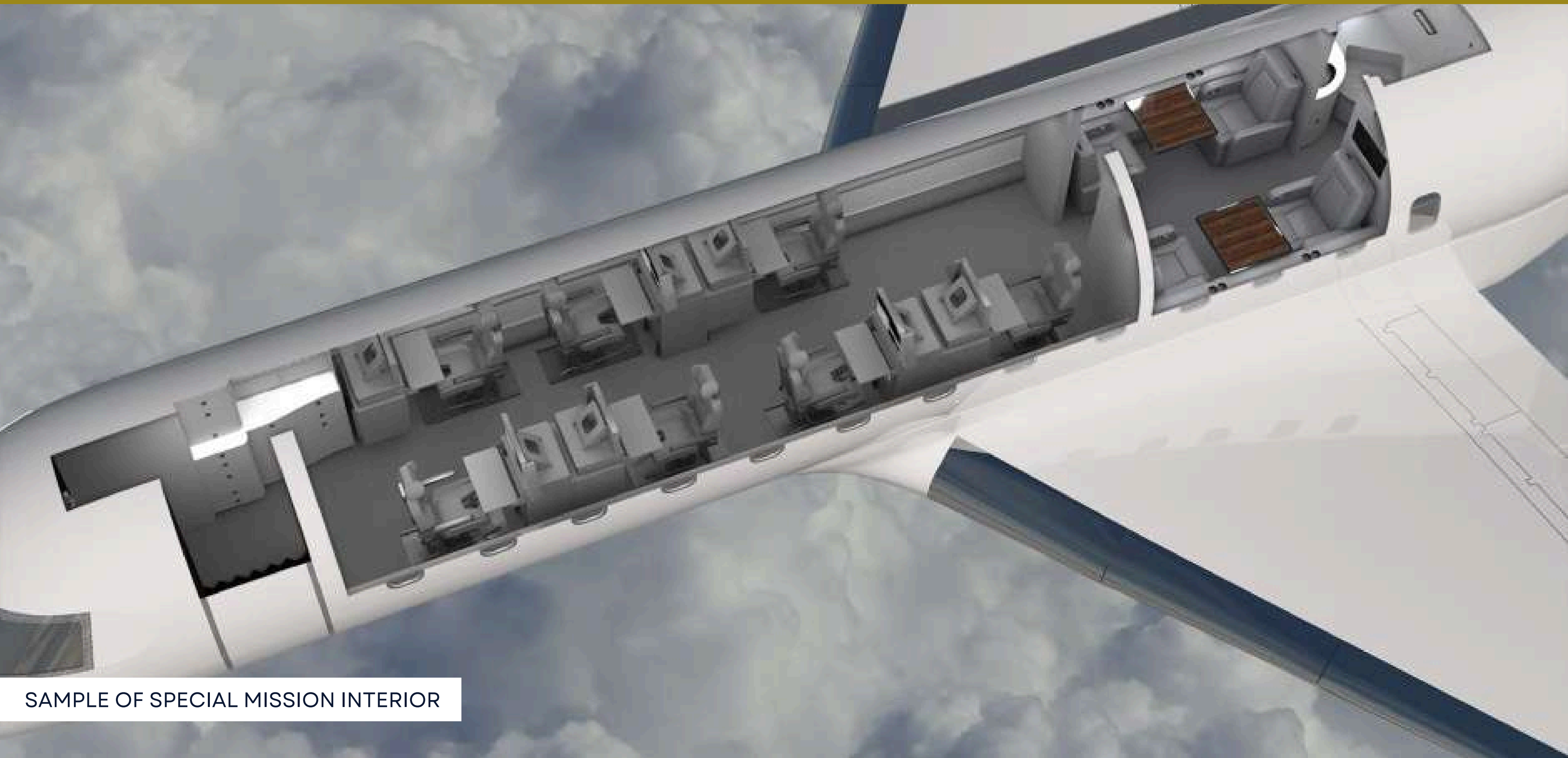
SAMPLE OF SPECIAL MISSION INTERIOR