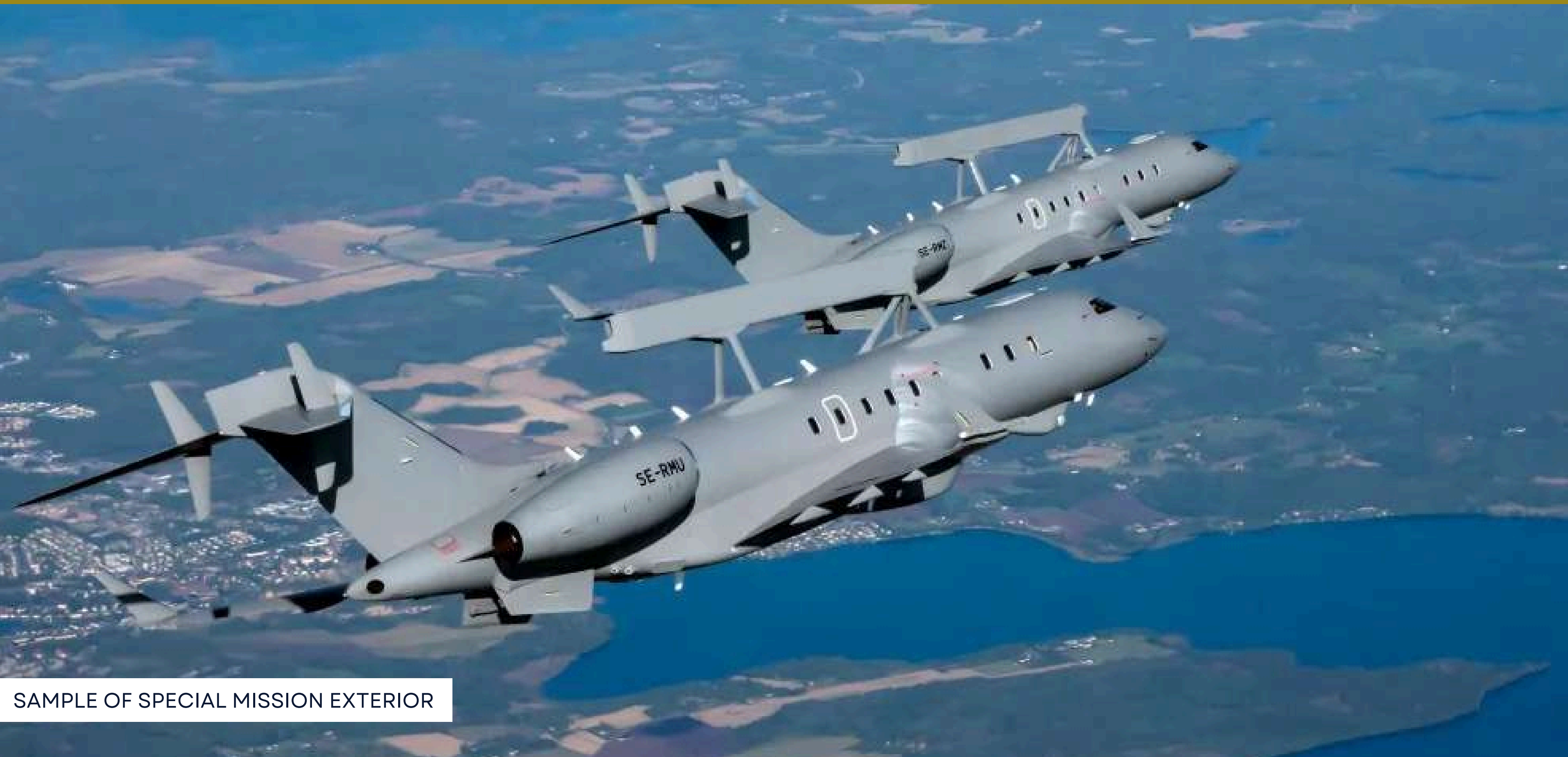
SAMPLE OF SPECIAL MISSION EXTERIOR