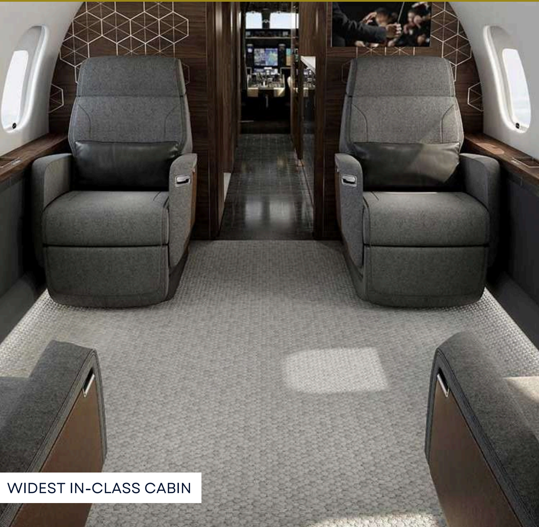
WIDEST IN-CLASS CABIN