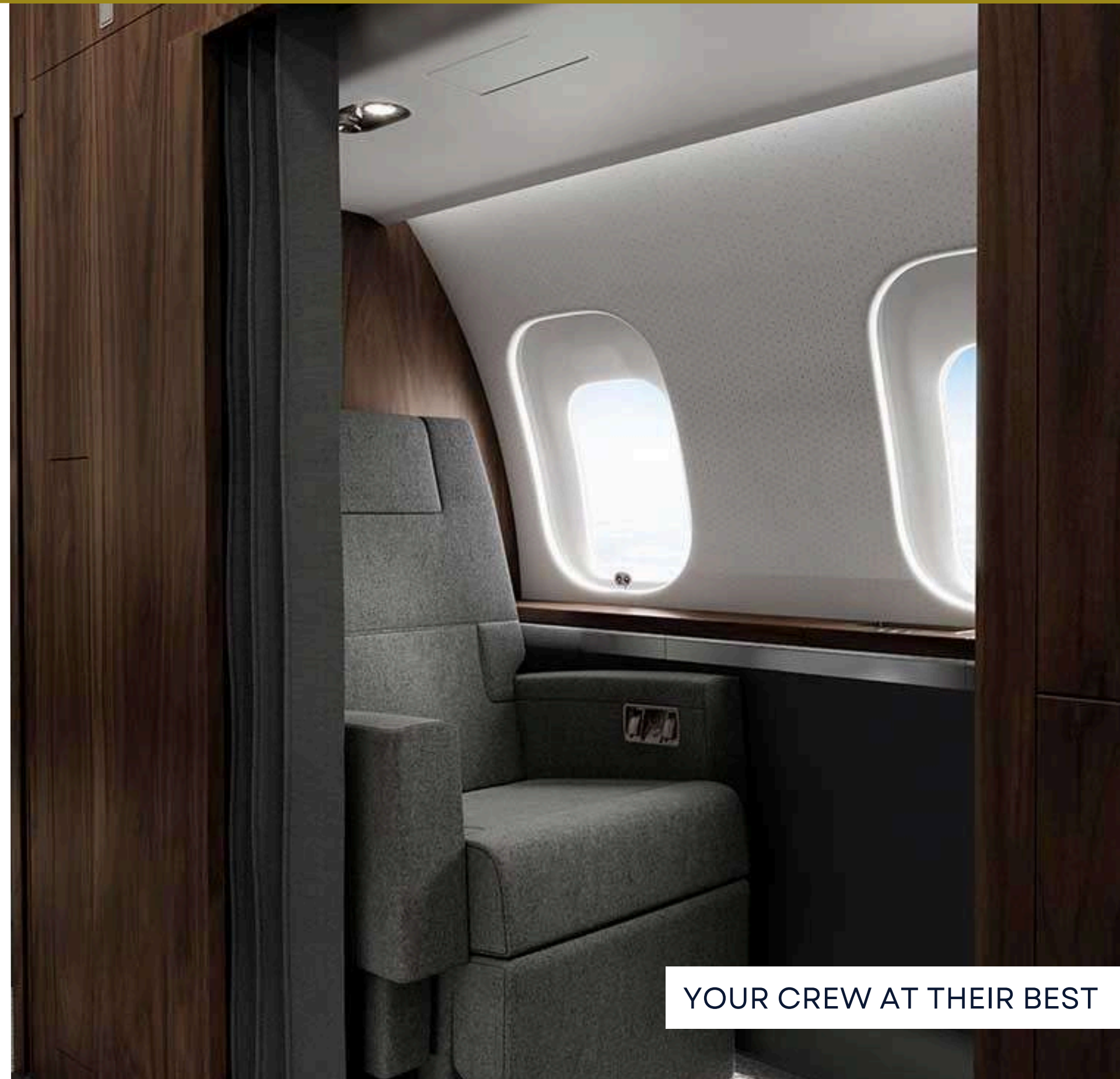
YOUR CREW AT THEIR BEST