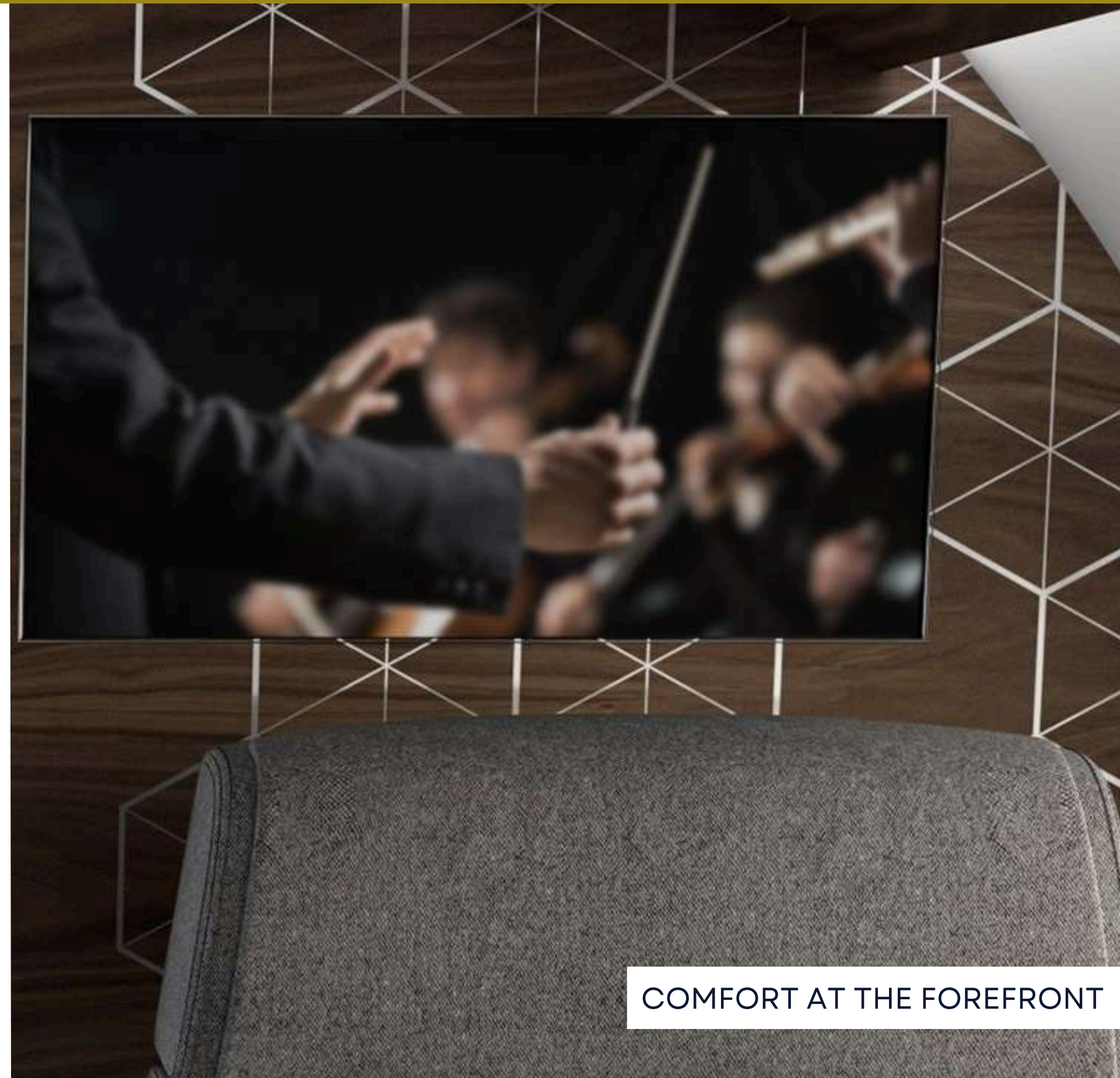
COMFORT AT THE FOREFRONT