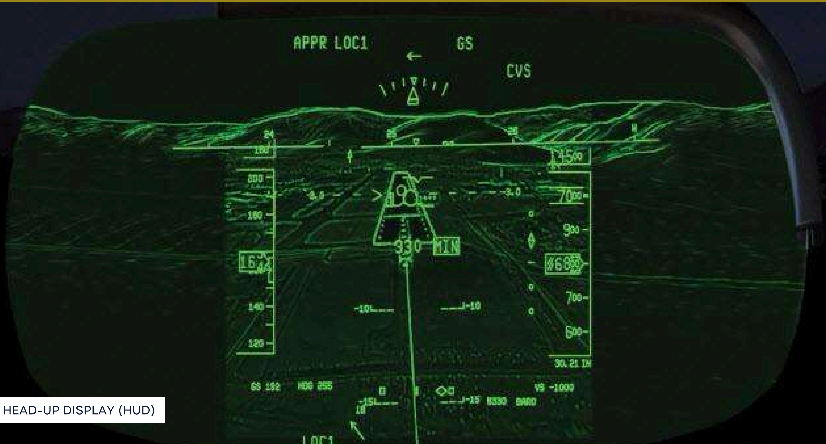
PILOT'S HEAD-UP DISPLAY (HUD)