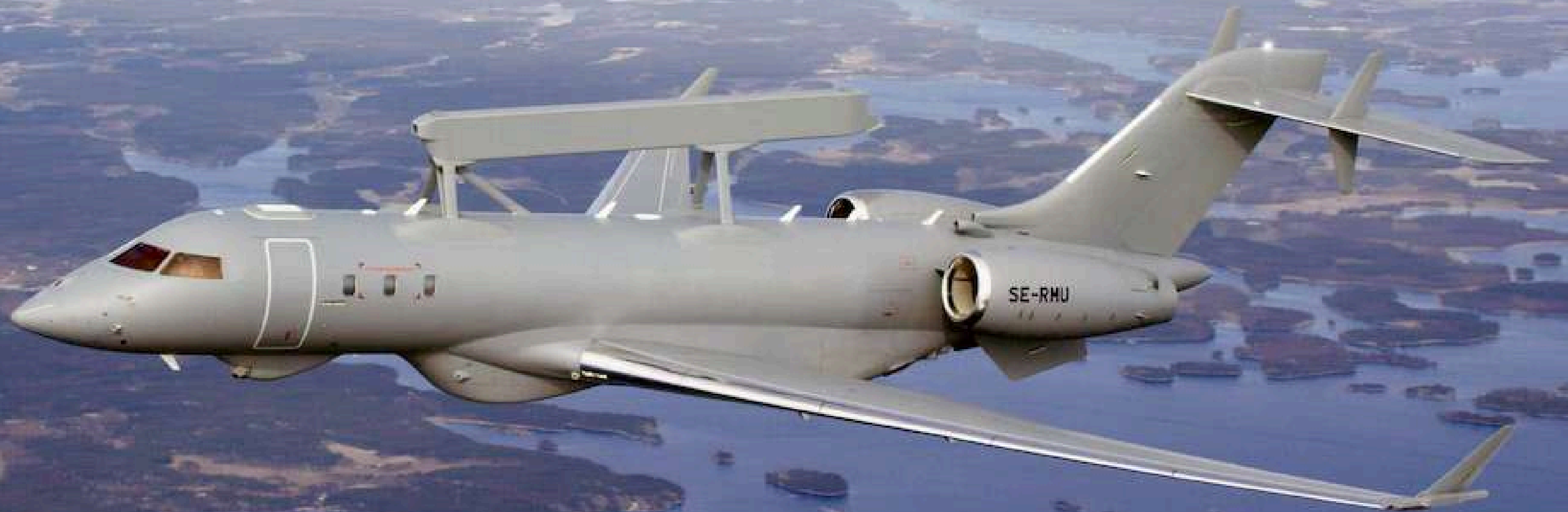
SAMPLE OF SPECIAL MISSION EXTERIOR