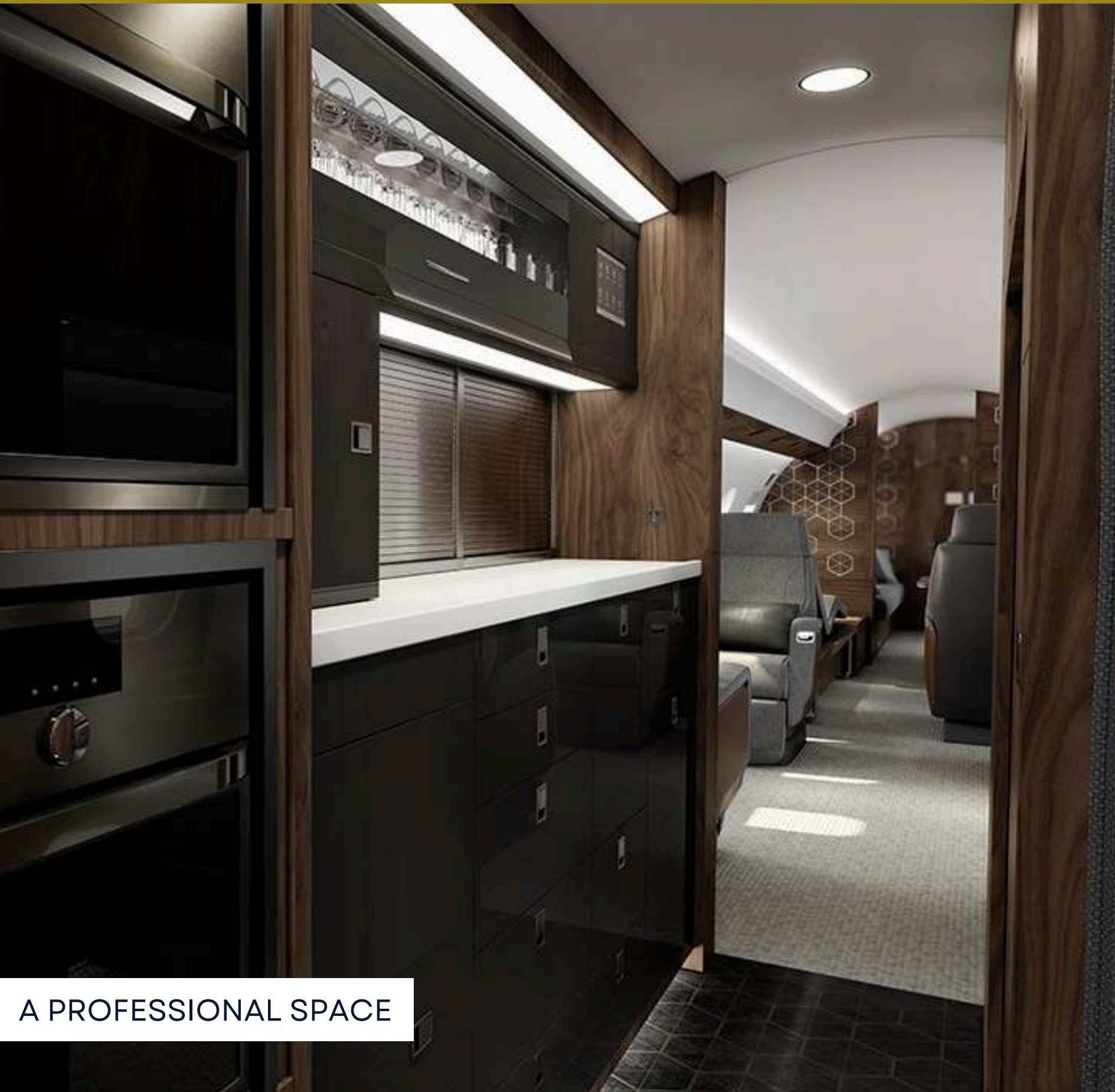
A PROFESSIONAL SPACE