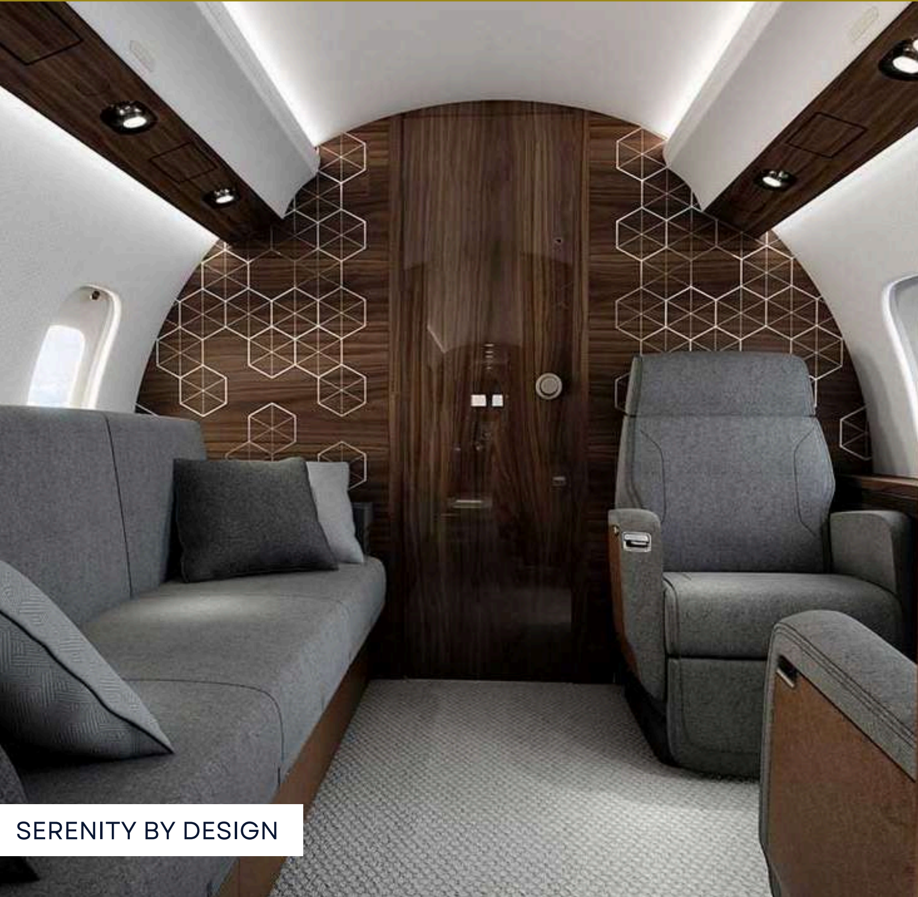
SERENITY BY DESIGN