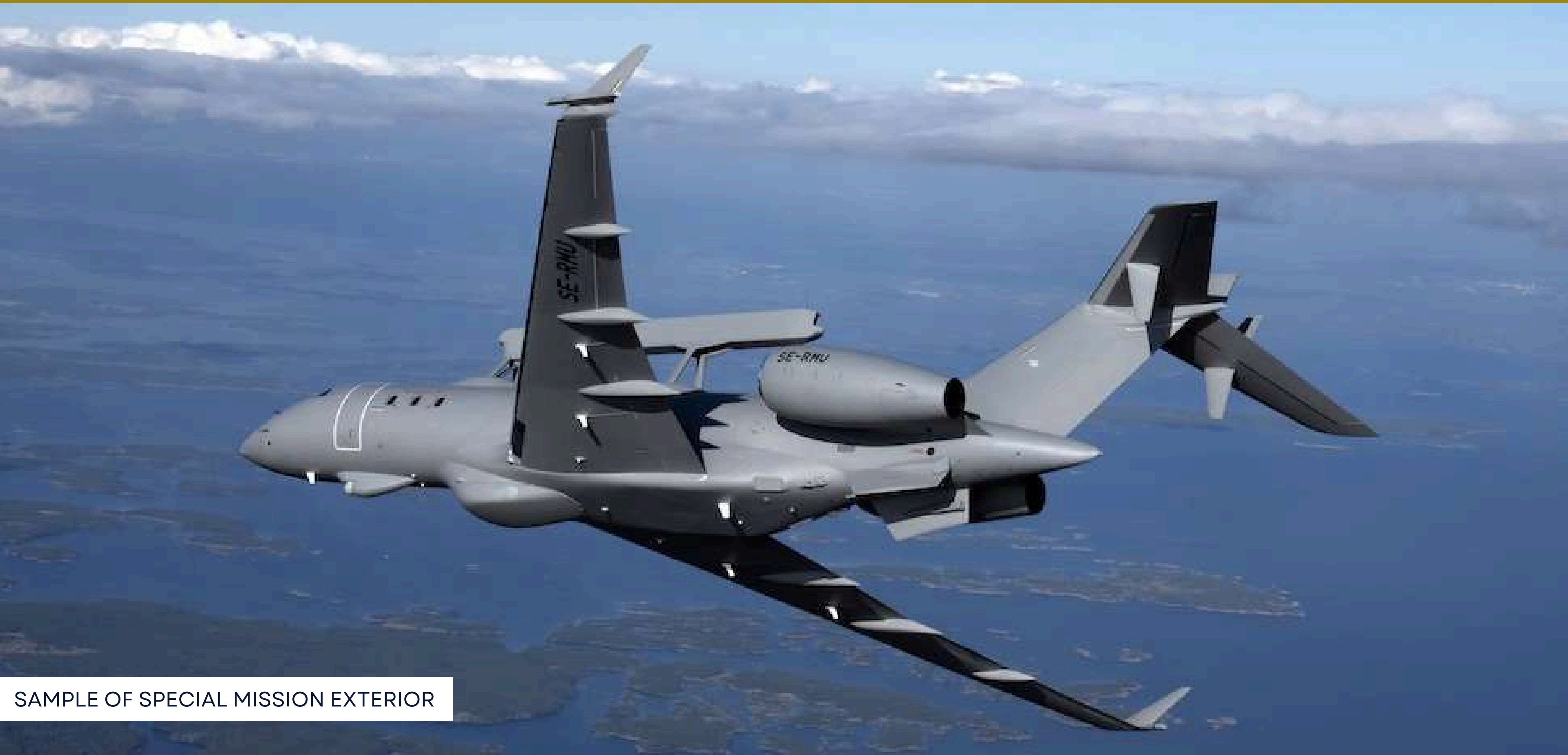
SAMPLE OF SPECIAL MISSION EXTERIOR