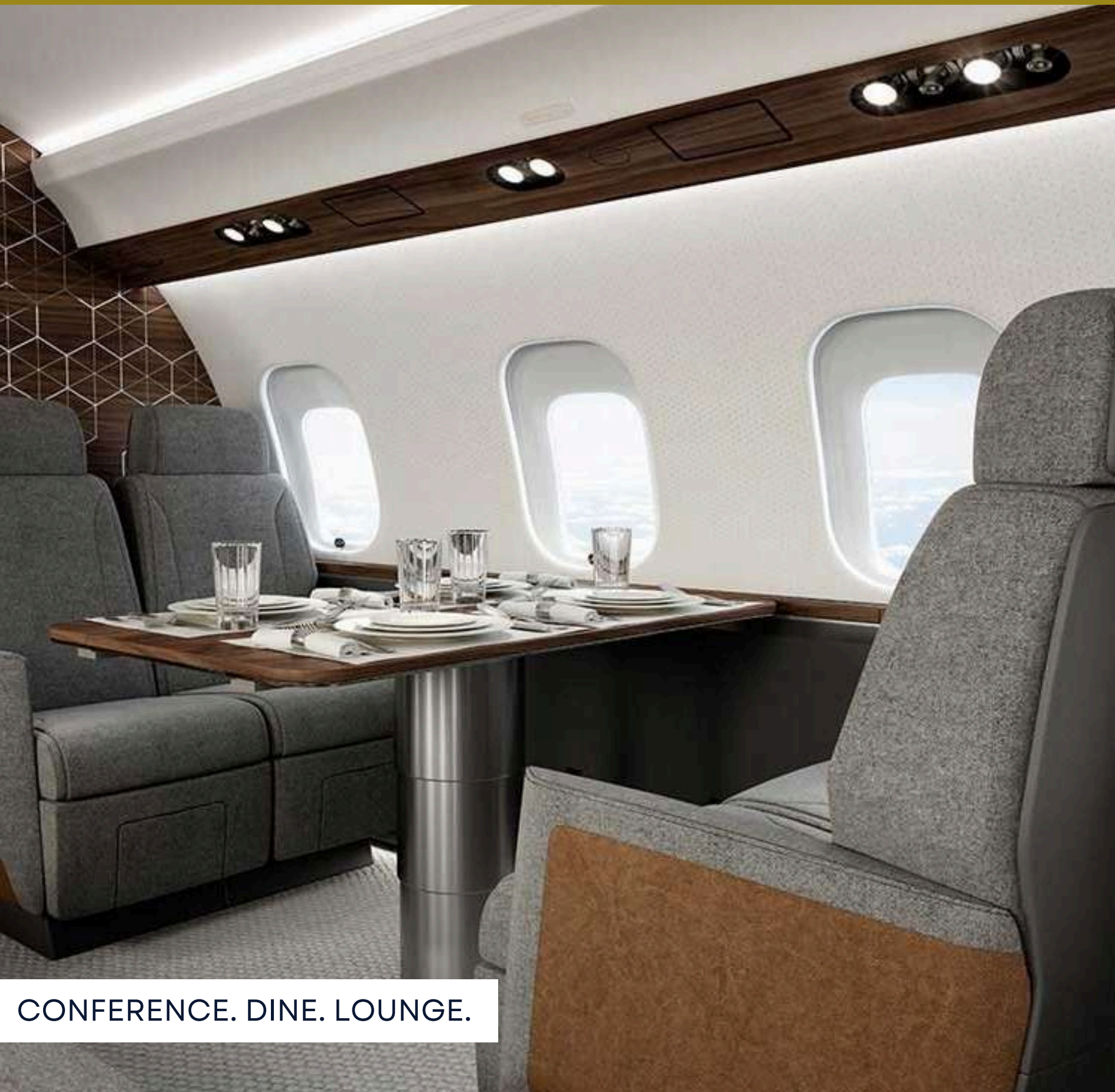
CONFERENCE. DINE. LOUNGE.