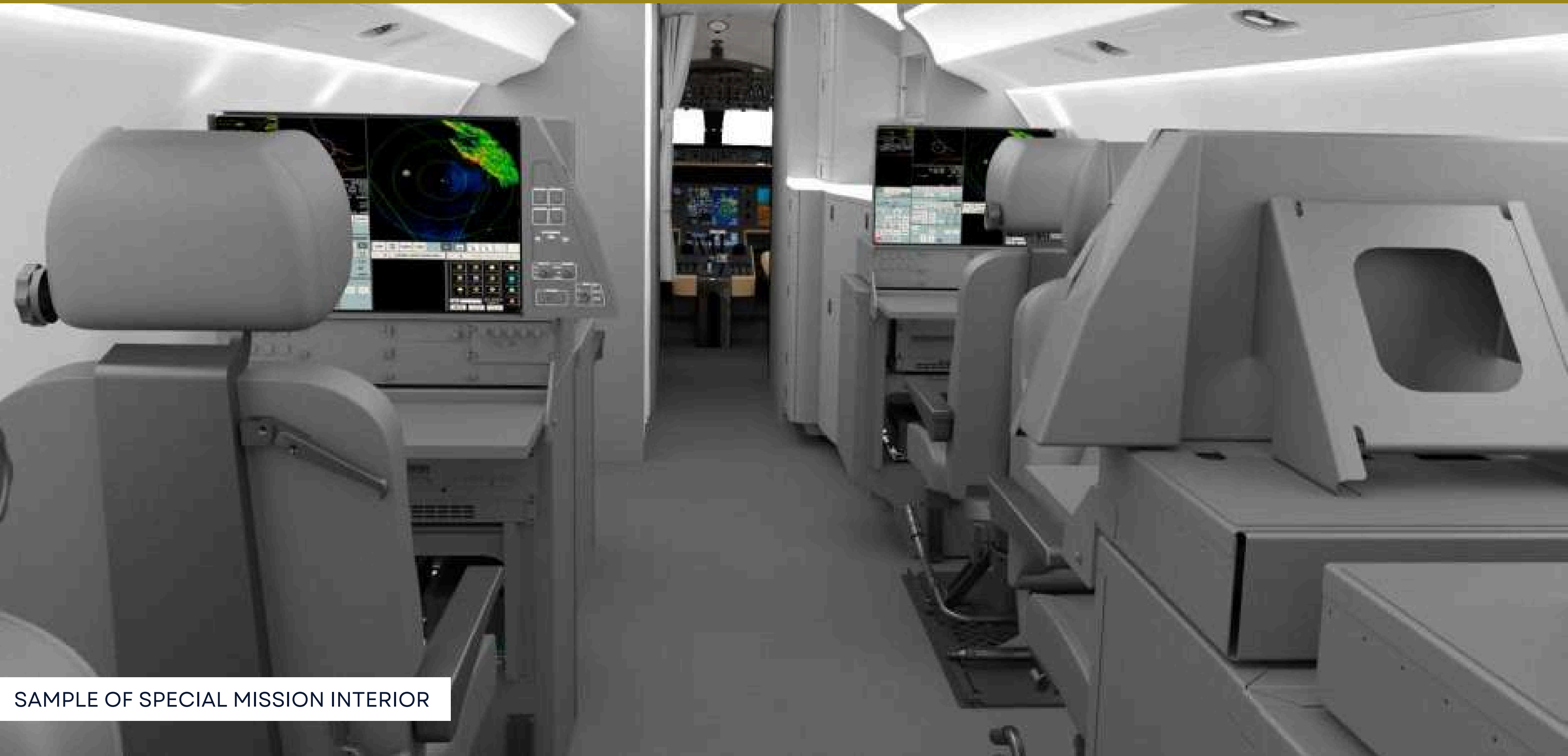
SAMPLE OF SPECIAL MISSION INTERIOR